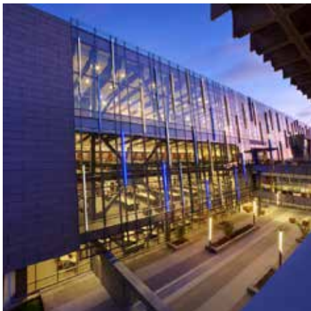
LEO F. CAIN LIBRARY