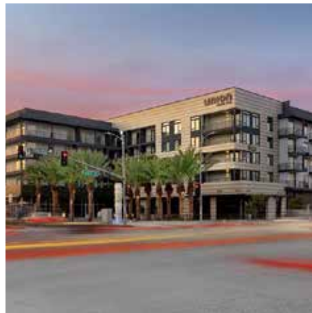
UNION AT SOUTH BAY