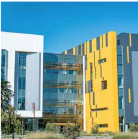
CALIFORNIA STATE UNIVERSITY DOMINGUEZ HILLS

Resumes will be screened based on the criteria outlined in this brochure. Candidates with the most relevant qualifications will be given preliminary interviews by the consultant. Koff & Associates will report the results to the City. The City will then select candidates to participate in panel interviews. Extensive reference and background checks will be completed on the selected candidate.