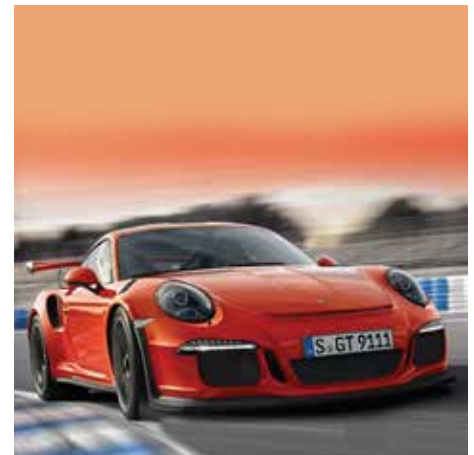
PORSCHE EXPERIENCE CENTER